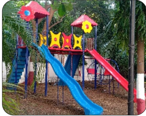
MPPS - 26 ( Thane )