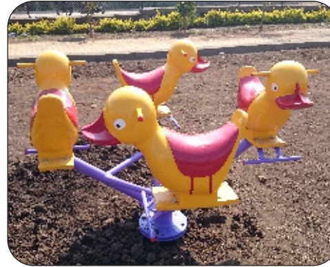
MGR - 02 ( FRP Animal MGR )