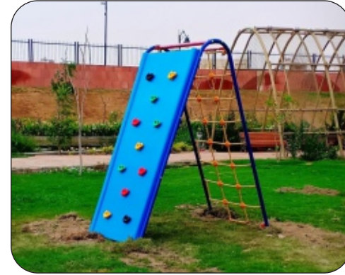
CLT - 13 ( Rock Climber )