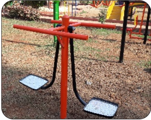
OG - 10 ( Double Pendulum )