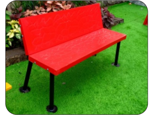
BD - 10 ( Premium FRP Bench )