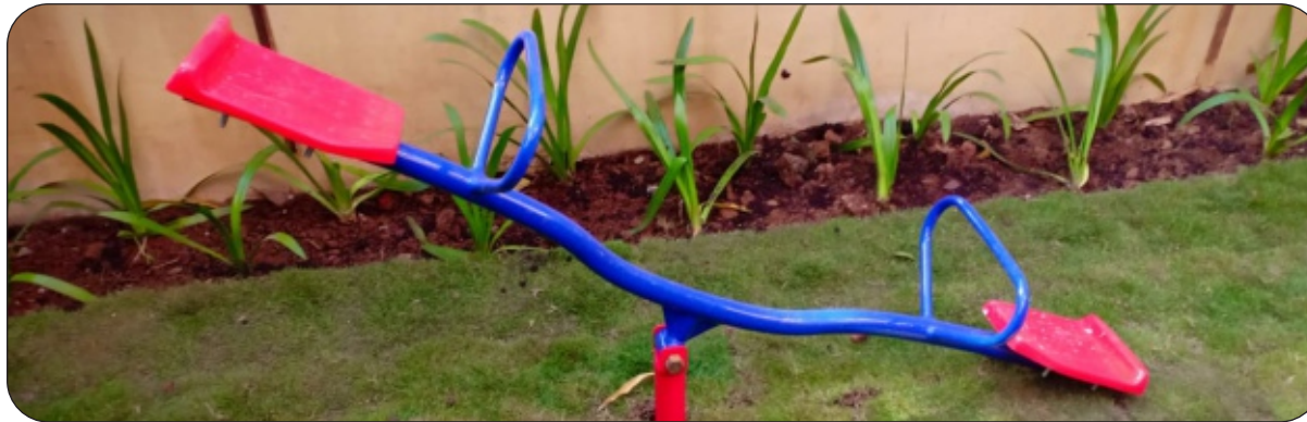
SS - 09 ( Premium See - Saw )