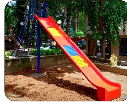
SL - 03 ( FRP Straight Roller Slide )