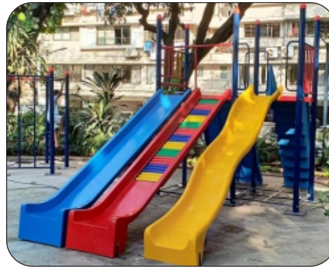
MPPS - 24 ( Pedder Road ) www. playglobal.in