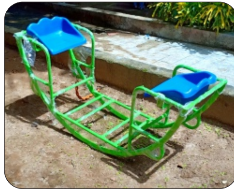
KD - 05 ( Rocking Boat ) www. playglobal.in