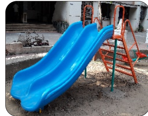
SL- 13 ( Roto Kids Double Slide )