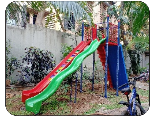
MPPS - 25 ( Dahisar )