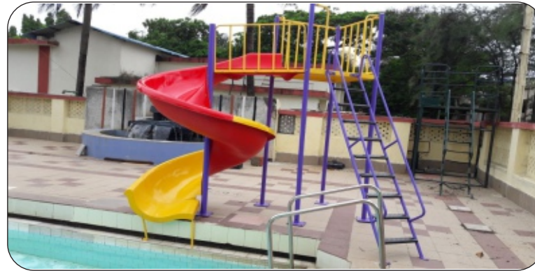
SL - 09 ( FRP Spiral Slide )