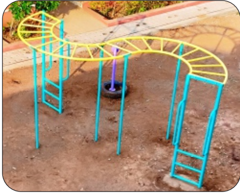
CLT - 08 ( S Bridge )