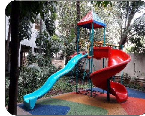
MPPS - 09 ( Malad )