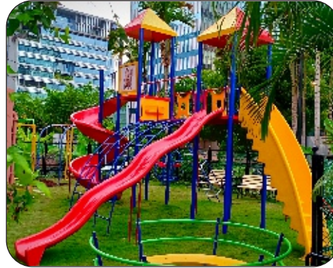
MPPS - 08 ( Bandra )