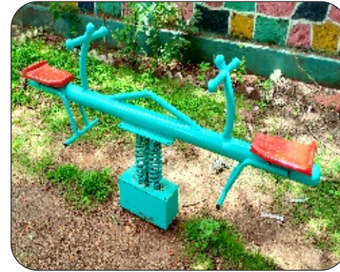
SS - 04 ( Spring See - Saw )