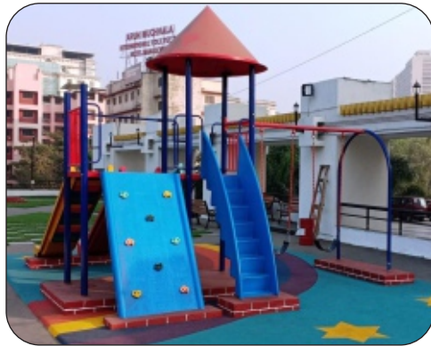
MPPS - 23 ( Thane )