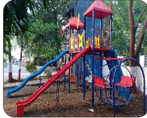
MPPS - 26 ( Thane )