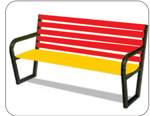
BD - 04 ( Deluxe Bench )