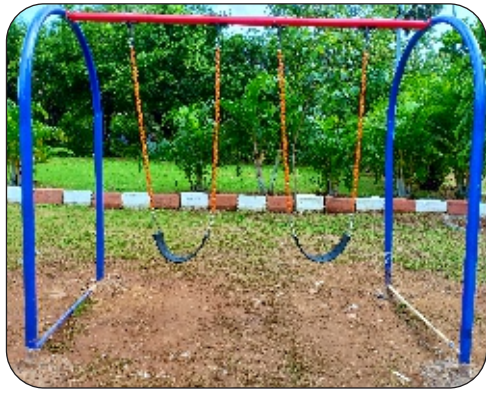
SW - 01 ( Double Swing )