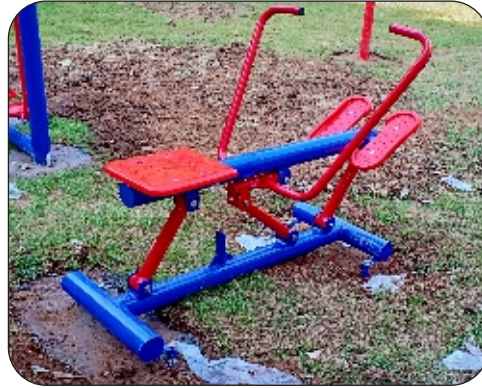
OG - 15 ( Rowing )