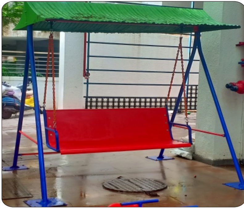
SW - 08 ( Premium Luxury Swing )