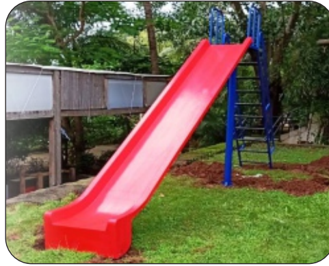
SL - 03 ( FRP Straight Slide )