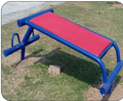
OG - 21 ( FRP AB Board )