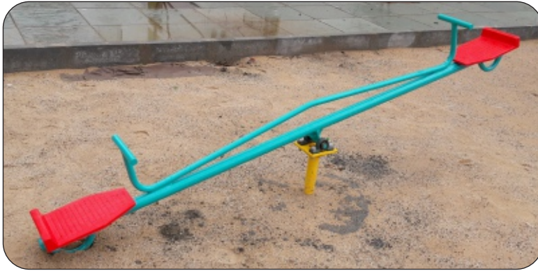
SS - 01 ( Standard See - Saw )