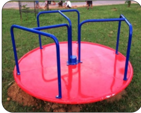
MGR - 01 ( FRP Platform MGR )