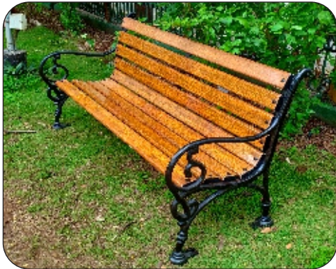
BD - 07 ( Cast Iron VIP Bench )