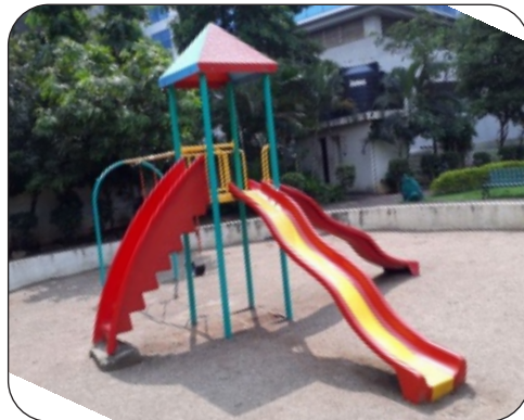
MPPS - 10 ( Goregaon )