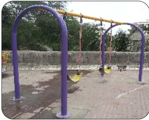
SW - 03 ( Double Swing )