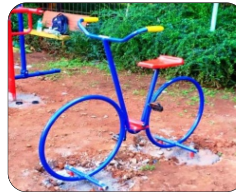
OG - 29 ( Cycle )