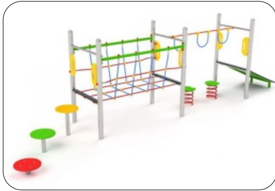
CLT- 15 ( Obstacle Course 2 )