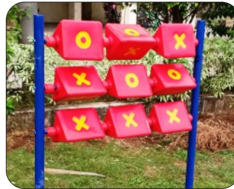
KD - 11 ( X & O )