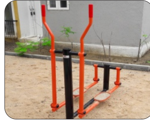
OG - 07 ( Stepper )