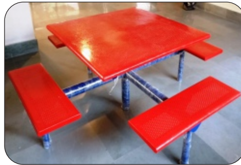
BD - 12 ( Picnic Table )