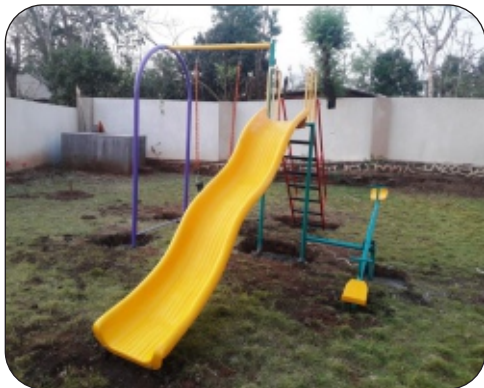
MPPS - 17 ( Wasind )