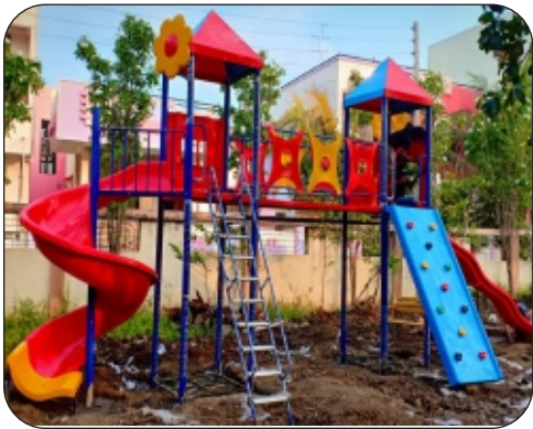
MPPS - 04 ( Parbhani )