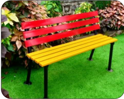
BD - 01 ( Economy Bench )