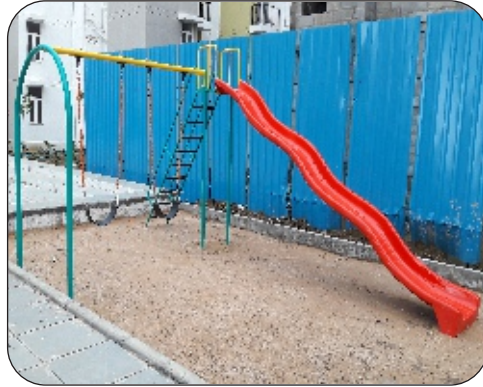
MPPS - 07 ( Boisar )