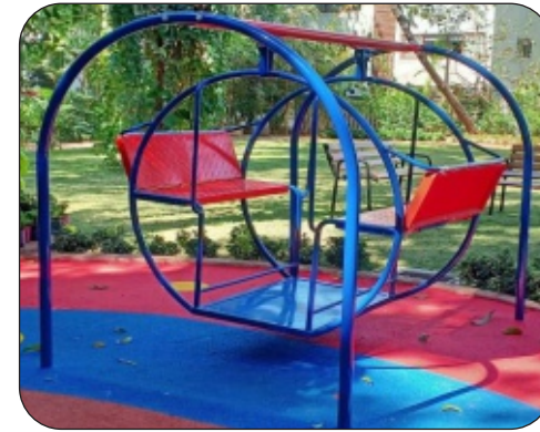
SW - 06 ( Multi Seater Circular Swing )