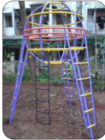
CLT- 02 ( Satellite Climber )