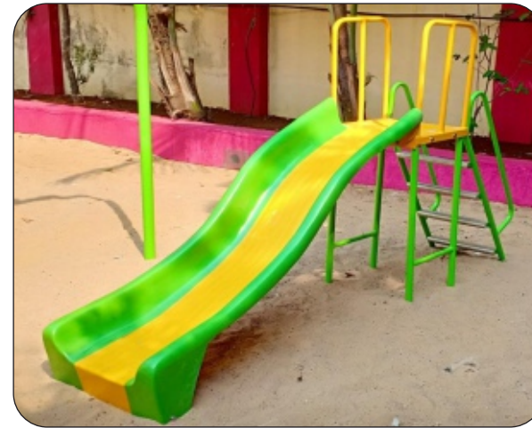
KD - 09 ( Kids Mini Slide )