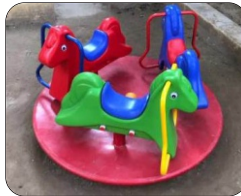
MGR - 05 ( FRP Platform Animal MGR )