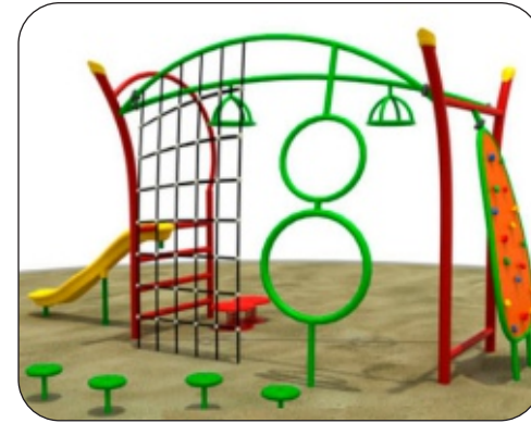
CLT- 14 ( Obstacle Course 1 )