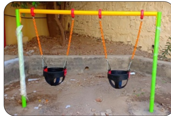
SW - 14 ( Single Pole Swing )