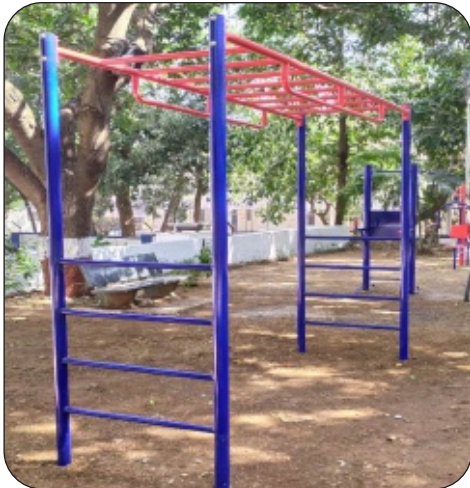
CLT - 07 ( Monkey Climber )