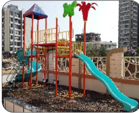
MPPS - 15 ( Bhayander )