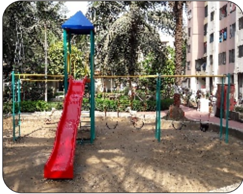
MPPS - 14 ( Thane )