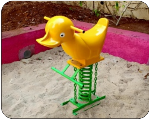
KD - 01 ( Spring Rider Duck )