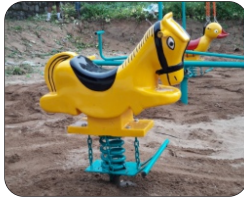
KD - 03 ( Spring Rider Horse )