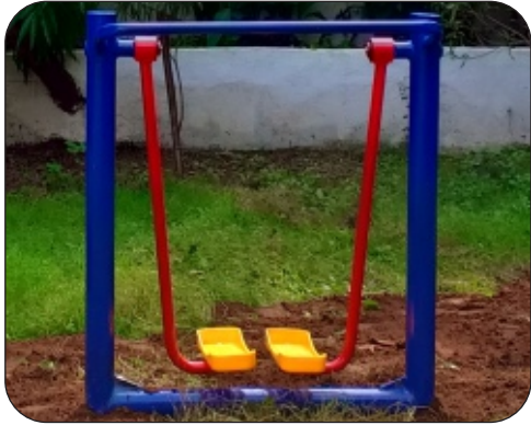
OG - 01 ( Sky Walker )