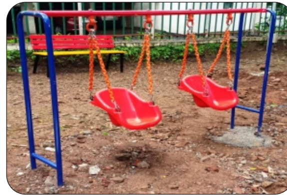
SW - 15 ( Mini Swing )