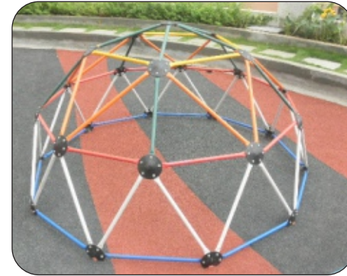
CLT- 01 ( Mini Sun Climber )