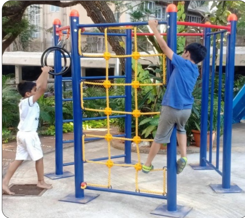
CLT - 12 ( Multi Climber )