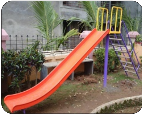
SL - 07 ( G.I Straight Slide )