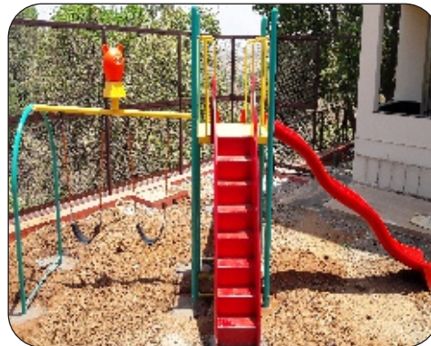
MPPS - 12 ( Igatpuri ) www.playglobal.in