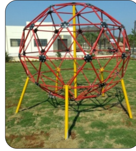
CLT - 06 ( Maze Climber )