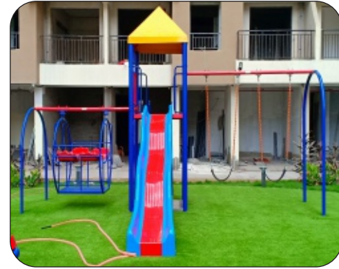
MPPS - 03 ( Virar )