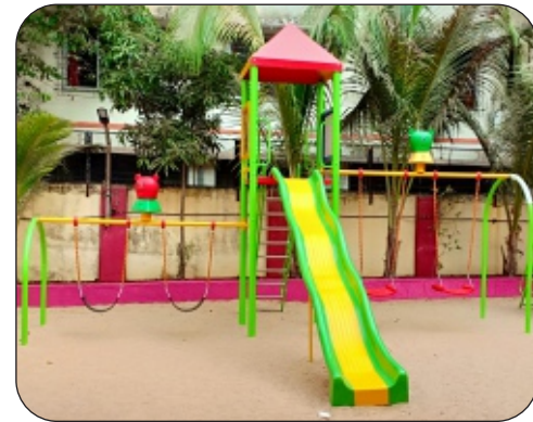
MPPS - 06 ( Thane )