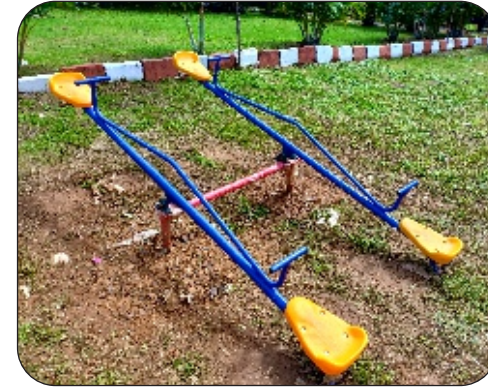
SS - 02 ( Four Seater See - Saw )