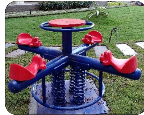
SS - 07 ( Four Seater Spring See - Saw )