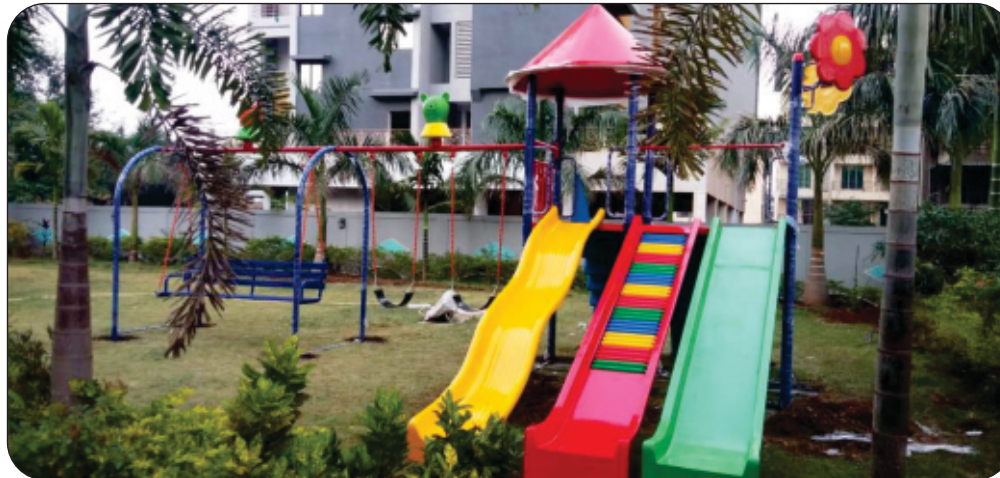
MPPS - 28 ( Ulwe )