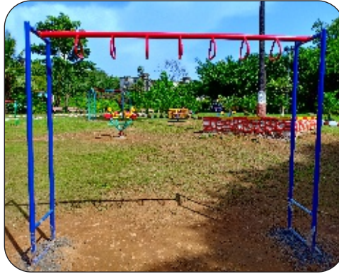
CLT - 10 ( Loop Rung )