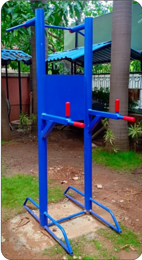
OG - 31 ( Pull Up Station )