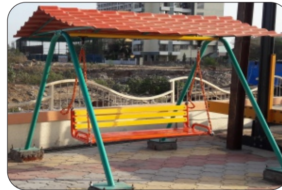
SW - 10 ( Garden Swing )