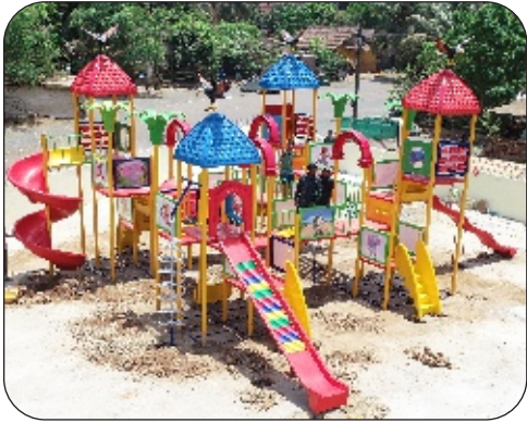
MPPS - 01 ( Goa )