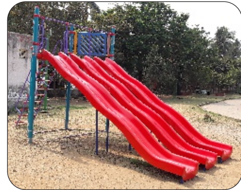
SL - 15 ( FRP Triple Wave Slide )