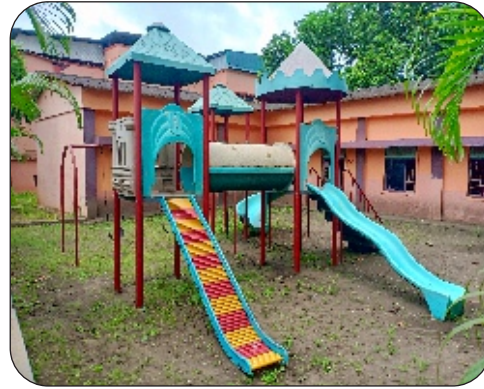
MPPS - 02 ( Vasai )