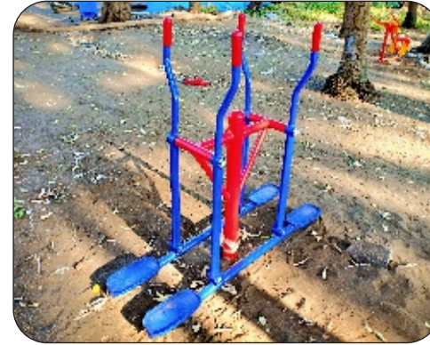
OG - 08 ( Double Stepper )