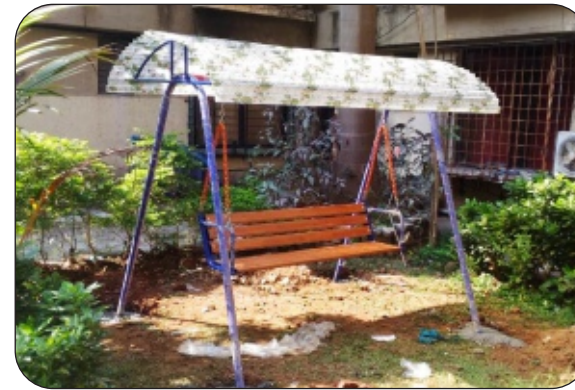
SW - 11 ( Economy Swing )