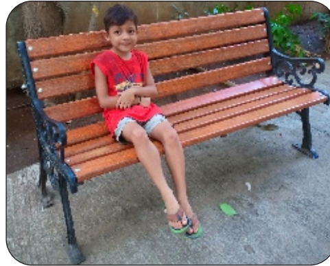
BD - 08 ( Cast Iron Economy )