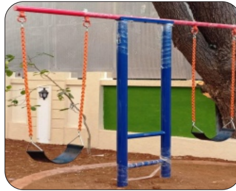
SW - 04 ( Arm Swing )