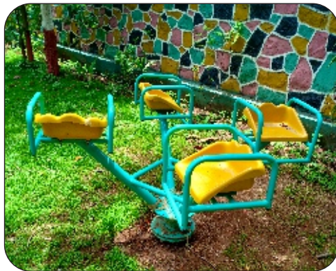
MGR - 04 ( FRP Four Seater MGR )