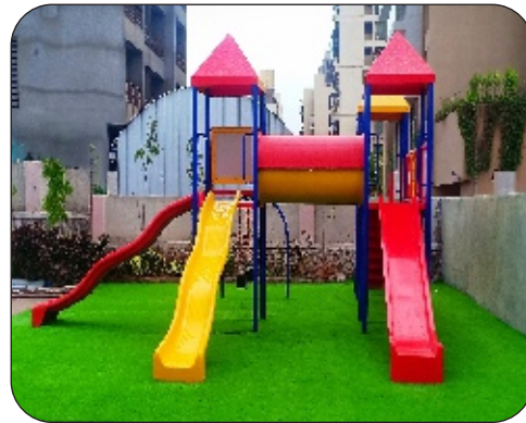
MPPS - 05 ( Ulwe )