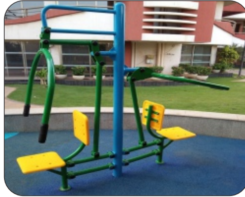
OG - 04 ( Chest Press/ Shoulder Press )