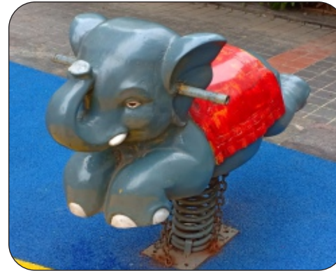
KD - 02 ( Spring Rider Elephant )