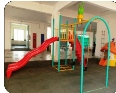
MPPS - 13 ( Kharghar )