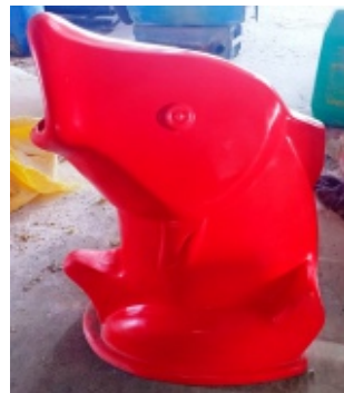
DB - 12 ( Dolphin )