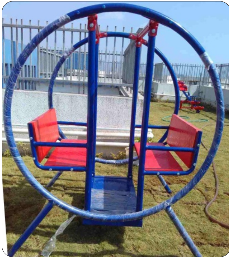
SW - 07 ( Premium Swing )