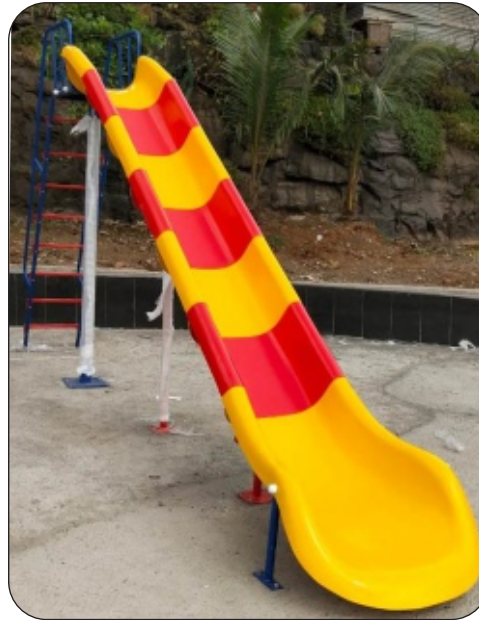
SL - 11 ( FRP Open Slide )