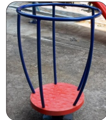
MGR - 06 ( Cup Spinner MGR )