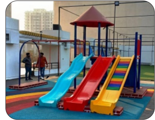
MPPS - 23 ( Thane )