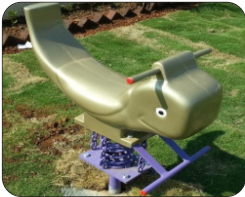
KD - 04 ( Spring Rider Fish )