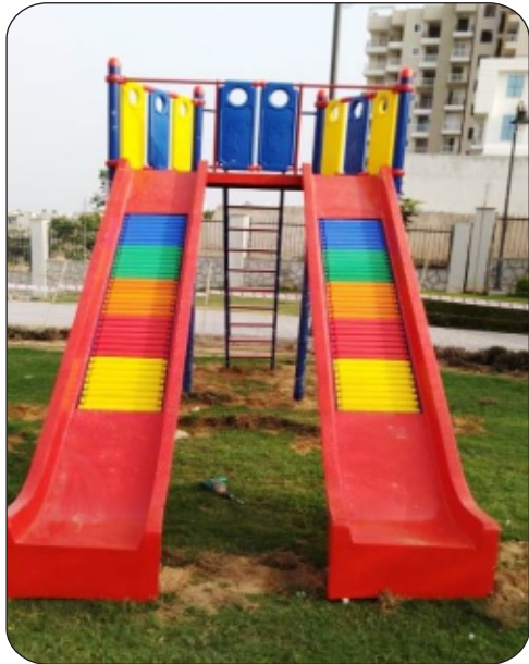
SL - 16 ( FRP Double Straight Roller Slide )