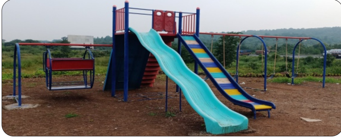
MPPS - 11 ( Manor )