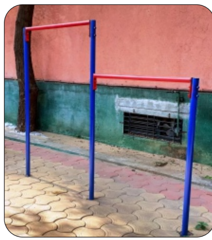
CLT - 17 ( Pull Up Bar )