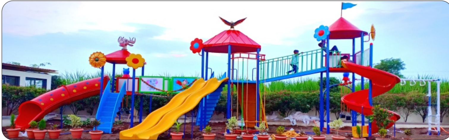
MPPS - 20 ( Baramati )