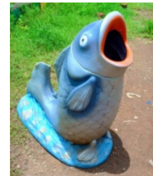
DB - 15 ( Fish )