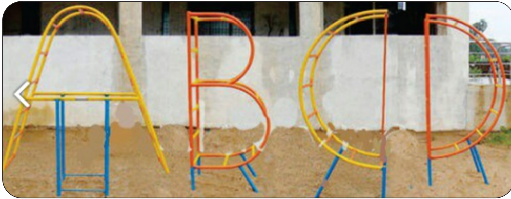
CLT- 01 ( Alphabet Climber )