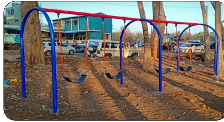
SW - 02 ( Four Seater Swing )