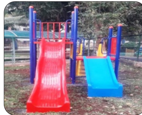
MPPS - 19 ( Colaba )