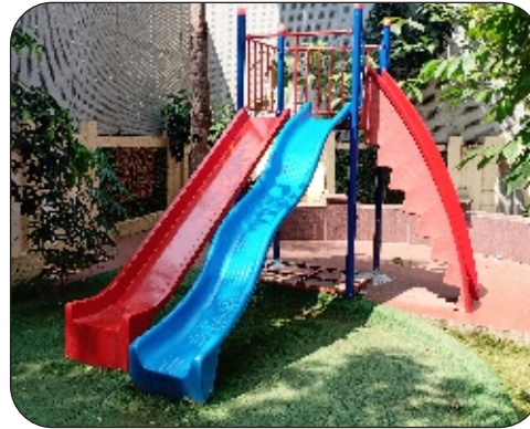
MPPS - 22 ( Marol )