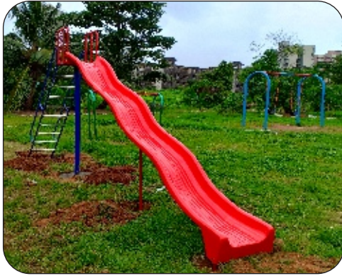
SL - 01 ( FRP Wave Slide )