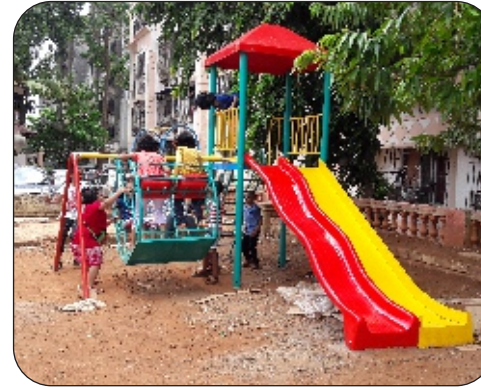
MPPS - 16 ( Nerul )