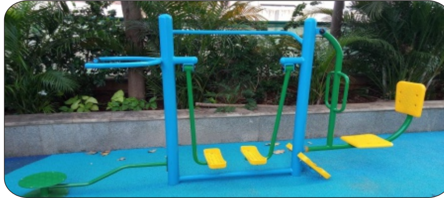
OG - 27 ( Twister / Walker / Leg Press )