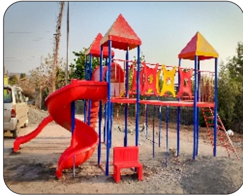
MPPS - 21 ( Ulwe )