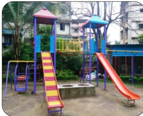
MPPS - 18 ( Mira Road )