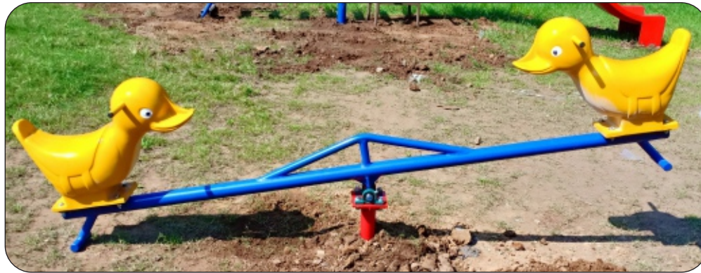
SS - 06 ( Animal See - Saw )