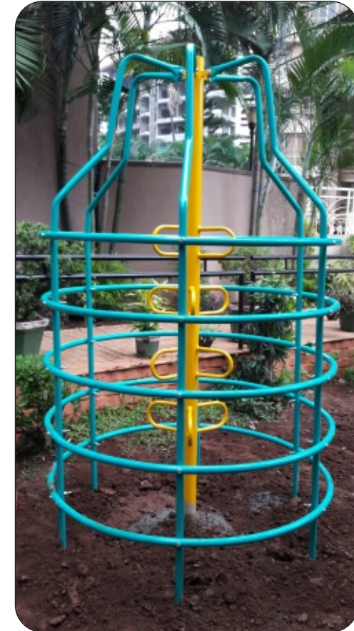
CLT - 04 ( Round Climber )