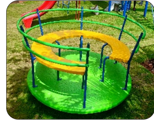
MGR - 03 ( FRP Seating MGR )