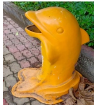
DB - 13 ( Whale )