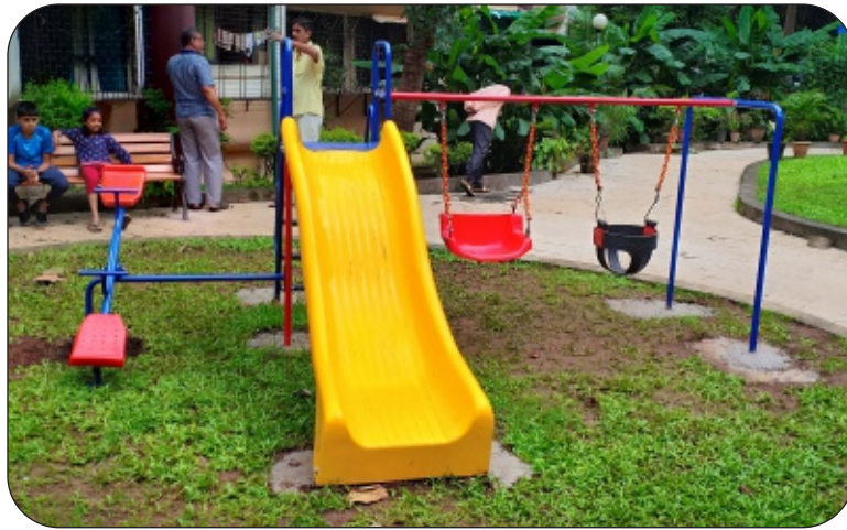
KD - 07 ( Kids Combination Set )