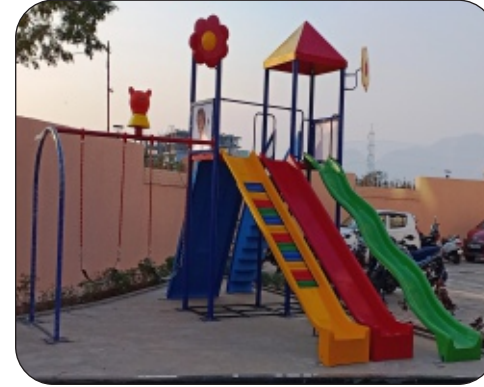
MPPS - 27 ( Karjat )